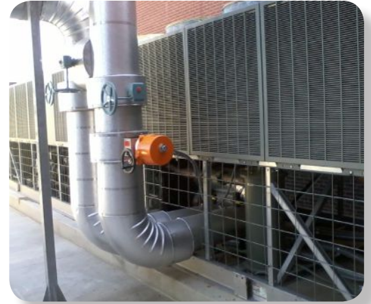
An air cooled chiller system at the LISD 9th and 10th Grade Center

a 478 kilowatt reduction. The district has earned a total of $80,478 in incentives from the program.