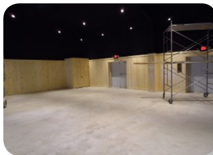
Coryell Community Church Youth Center Sanctuary

The church received $2,085 in Commercial Solutions incentives for its first project.