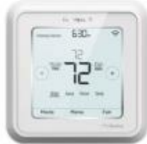
Honeywell Lyric T6 Pro Wi-Fi II