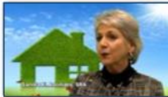
AI's Residential Green and Energy Efficient

Appraisal Institute offers a variety of resources centered around the valuation of sustainable properties.